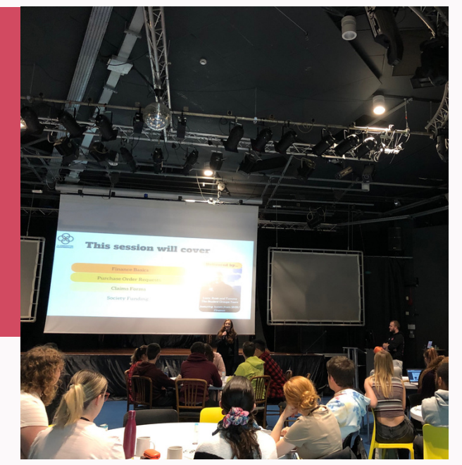
Committee Conference 2022