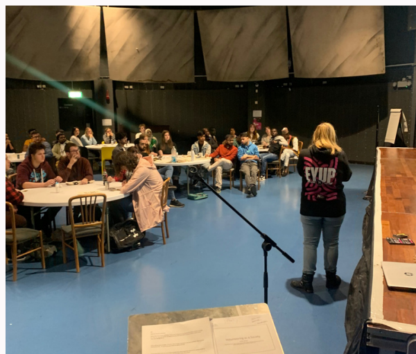
Committee Conference 2022