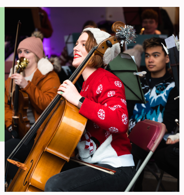
Band Christmas Concert 2022