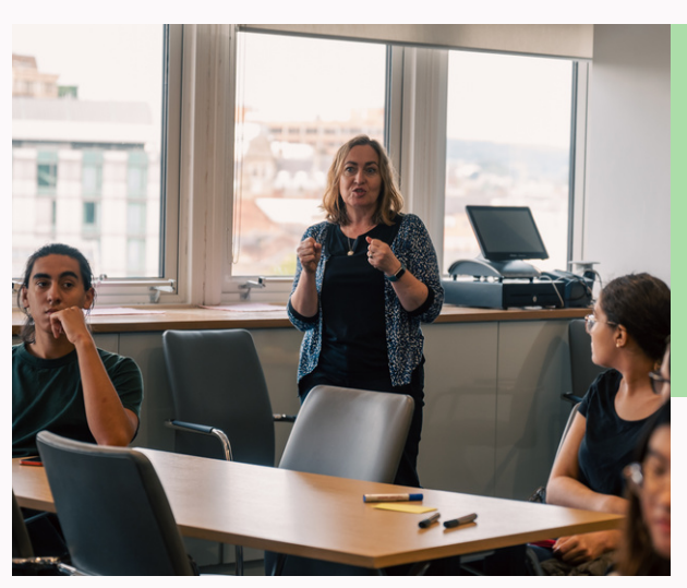
Food and Nutrition GIAG 2023